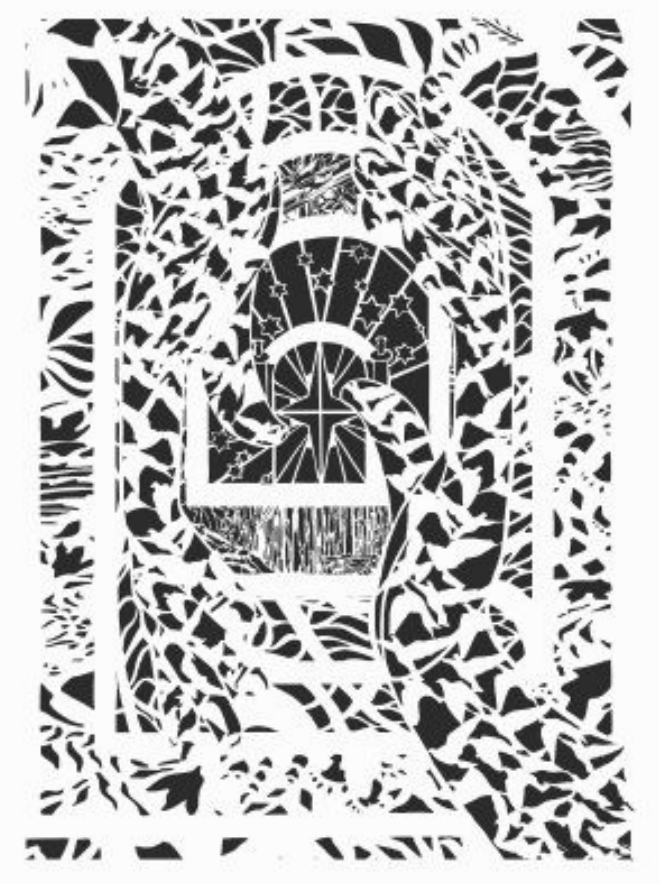
Close to Home | Seeking Sanctuary (Love) Advent Week 4

Service of the Word Organ/Piano-Led Worship December 21 & 22, 2024 | 5:00 pm, 8:30 am, 9:45 am